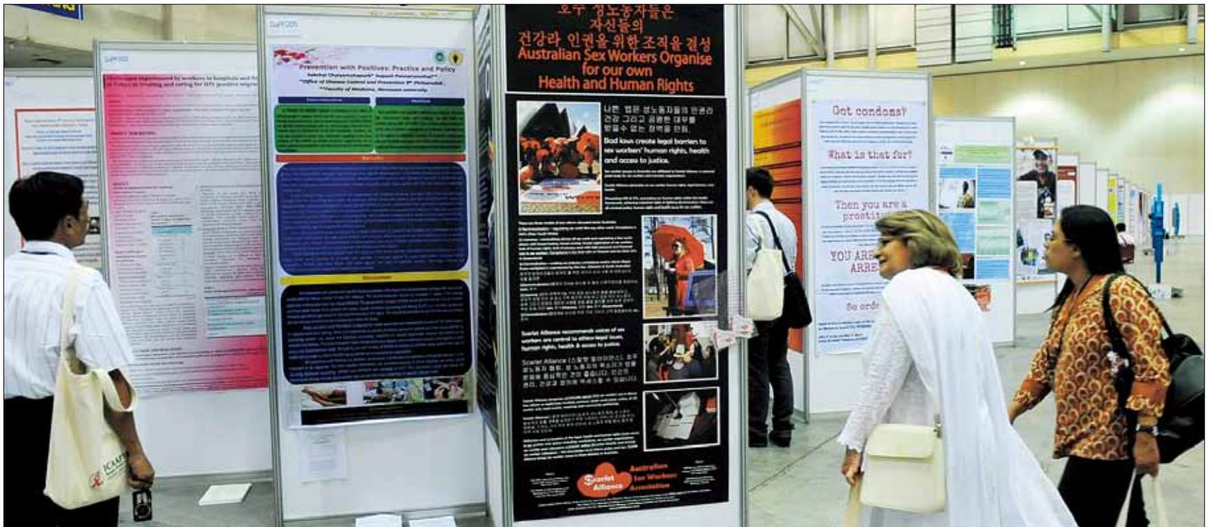
Various posters on HIV/AIDS are displayed at the exhibition hall.