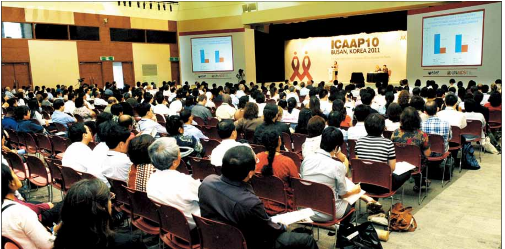
ICAAP10 participants attend the third plenary session at BEXCO on Sunday.