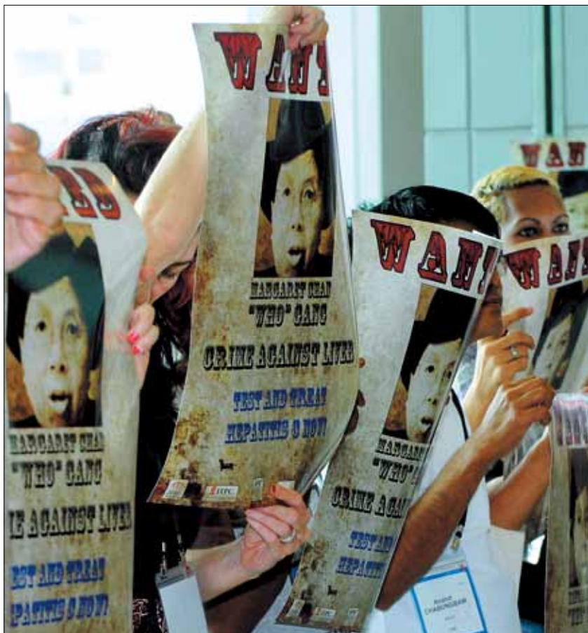
Activists hold posters demanding the WHO pay more attention to people with hepatitis C.