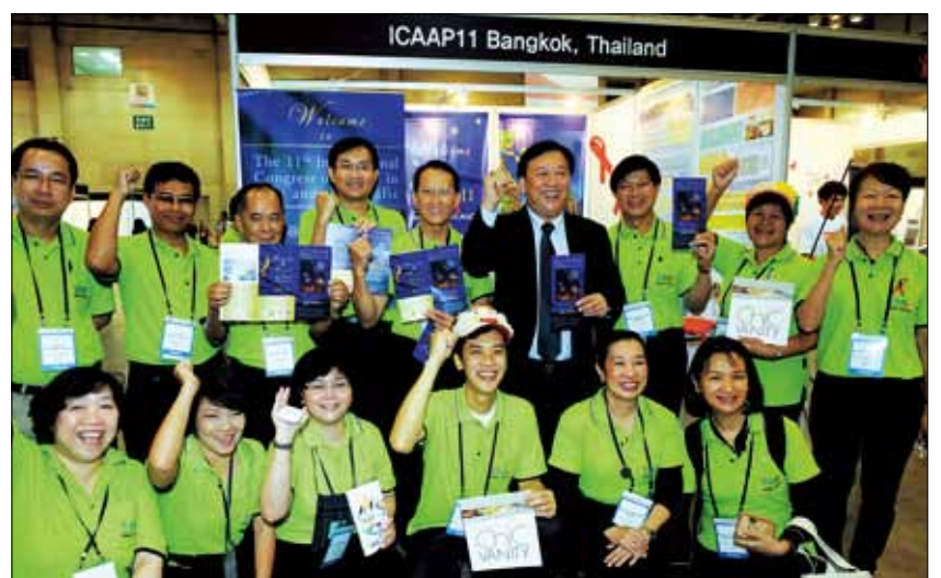
Participants from Thailand promote the next ICAAP to be held in Bangkok, Thailand, in 2013.