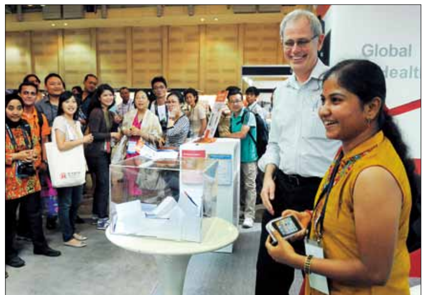
A woman smiles after winning an iPod Touch in a lucky draw at the exhibition hall.