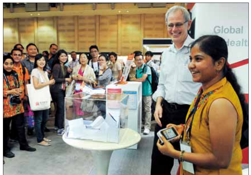
A woman smiles after winning an iPod Touch in a lucky draw at the exhibition hall.