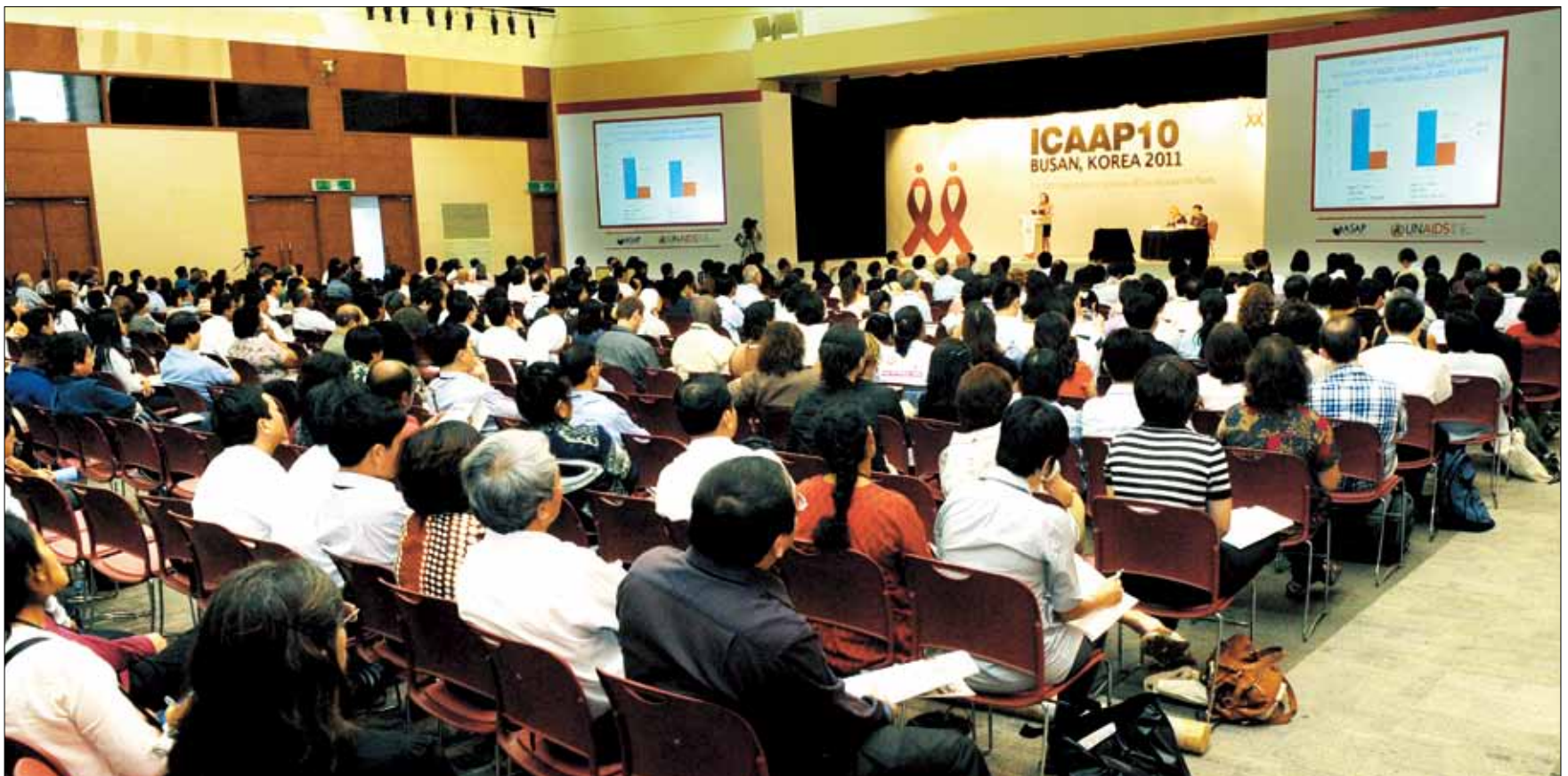
ICAAP10 participants attend the third plenary session at BEXCO on Sunday.