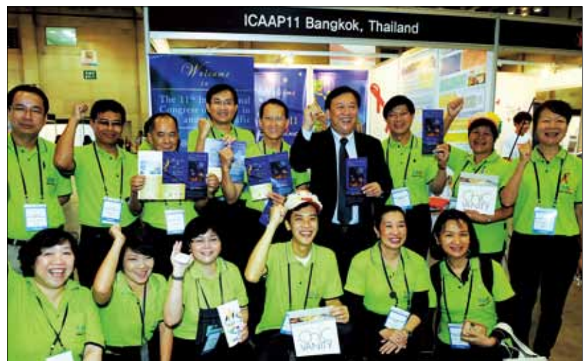
Participants from Thailand promote the next ICAAP to be held in Bangkok, Thailand, in 2013.